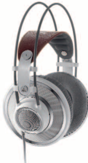
AKG Acoustics K 701 headphone

DESCRIPTION Open-back, circum-aural, dynamic headphones with neodymium magnet system. Frequency range: 10Hz–39.8kHz. Impedance at 1kHz: 62 ohms. Sensitivity: 105dB/V. Maximum input power: 200mW. Acoustic seal: open. Ear coupler: full size. Driver: dynamic. Coupler: large. Cable: 99.99% OFC, “balanced” (separate ground for each channel). Cord: 10', straight, left side. Connector: ¼”.